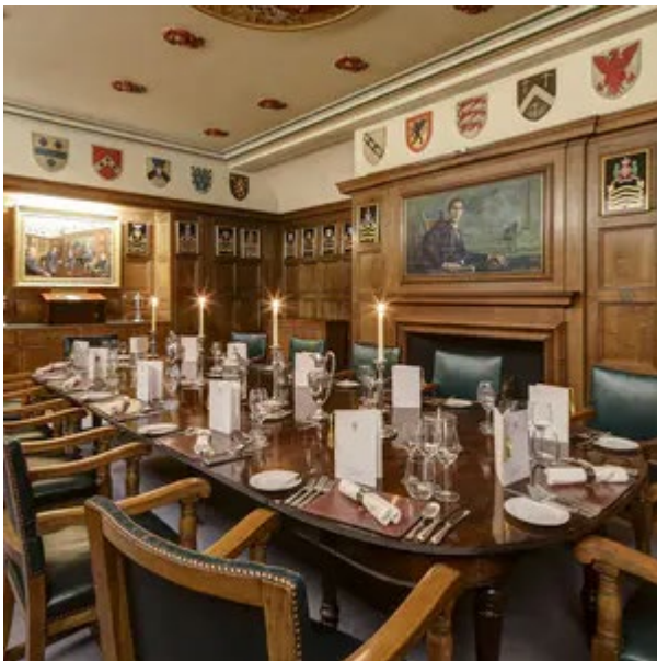
The Small Pension Room, Gray’s Inn