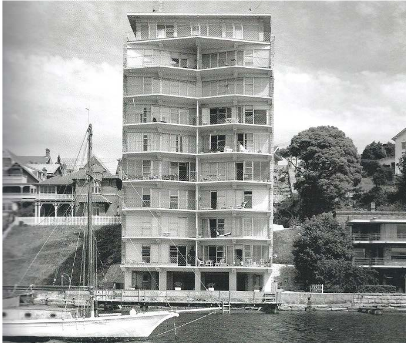
Sydney Harbour 18

This picture illustrates clearly why a land owner might want a restrictive covenant: