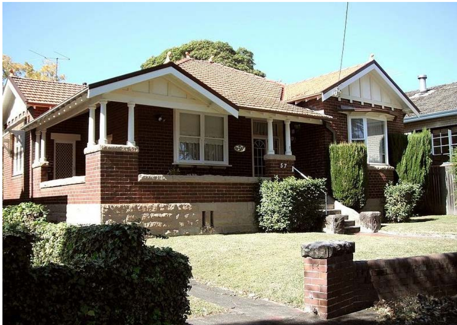
Haberfield, Sydney; brick and tile, minimum allotment size covenant 19

And this illustrates what restrictive covenant law can achieve: